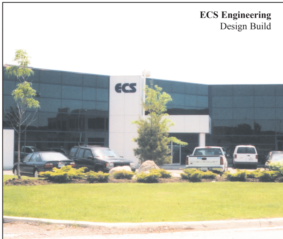
ECS Engineering Design Build

Greenwin Property Management, Rio Can Real Estate Investment Trust, O&Y CB Richard Ellis, Park Willow Management, Pinedale Properties Ltd, G and S Regal Property Management and Yonge Eglinton Centre.