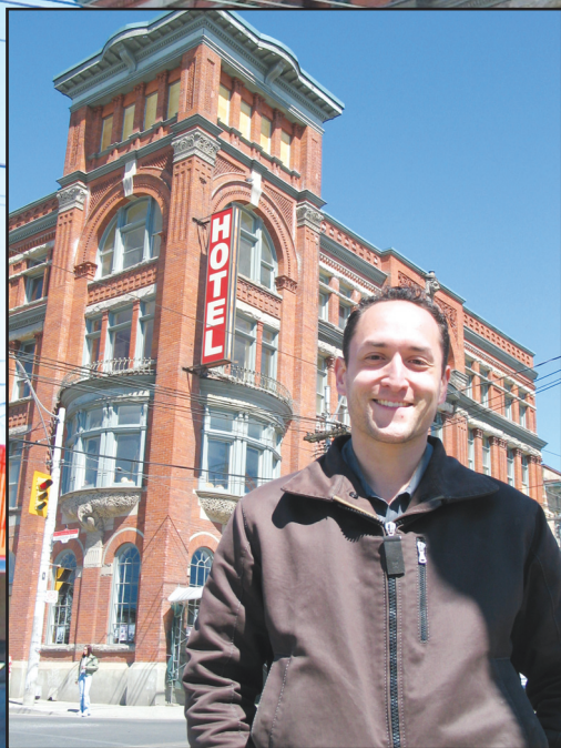
Gladstone Hotel Toronto ON.